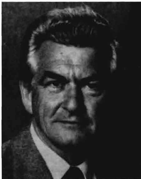
Bob Hawke is uncaring

The more homos that enter Australia, the more Australians will get AIDS. Prime Minister Bob Hawke could care less. He and his pack of race-crunching pols and money-men don't want upstanding immigrants, they want nonwhites in order to turn Australia brown. If these egalitarian politicians get AIDS -- which, because of their yen for nonstandard lifestyles, they stand a much better chance of catching than the ordinary Aussie -- they may have cause (too late, of course) to regret their plague-threatening immigration policies.