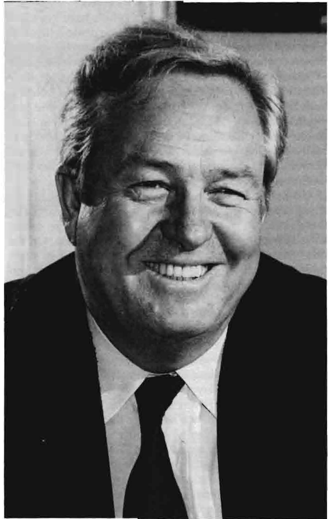
Jean-Marie Le Pen — one delegate, millions of votes.

Although rampant in the four elections, the wave of dirty politics had actually started a few years earlier, when France's sleazy political establishment changed the rules after Le Pen's Front National had amazingly won 35 National Assembly seats in the 1986 election, under a proportional representation system of balloting. PR voting means that the leading candidate in a constituency (similar to a U.S. congressional district) wins, provided he gets 12½% or more of the vote. The new winner-take-all system, on the other hand, calls for a second round, as in the presidential election, if no candidate gets more than 50% of the